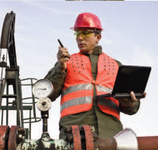
Self-Op Temperature Regulators