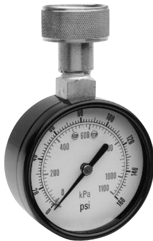
Water Test Gauge