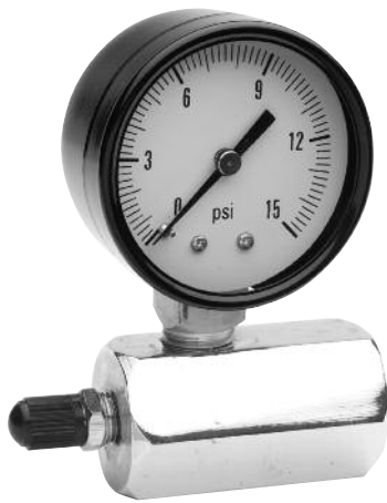
Gas Test Gauge