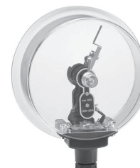
Electric Contact Configurations

Electric contact assemblies can be supplied on most 4", 4 1/2" and 6" pressure gauges. These units are well suited for making the electrical contact required to activate alarms, signals, or other electrical devices. Each unit is provided with an external adjustment key, making it easy to adjust and providing for tamper-resistant operation. The contacts have adjustable magnets to eliminate pointer bounce caused by vibration, and have pass/repass capability, allowing the pointer to move past the set point while maintaining contact. For applications that require a liquid-filled gauge, a special inductive type contact is required. Please consult factory for additional information.